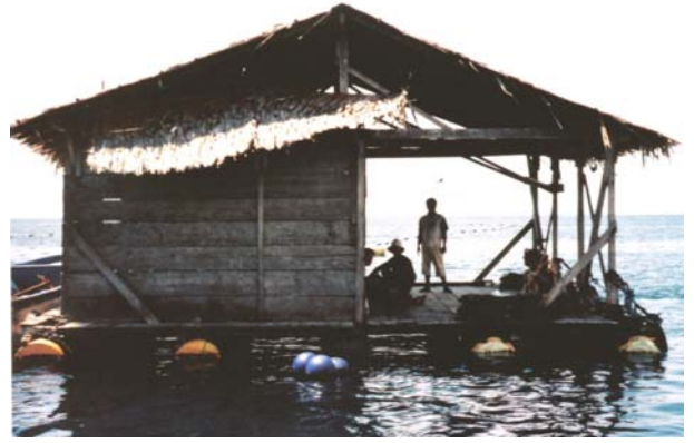
Main working platform

A structured approach to sustainable pearl farming was observed at Popo, which is also a popular dive site with visitors wishing to spot the elusive rinophias fish, sea horses and other rare critters.