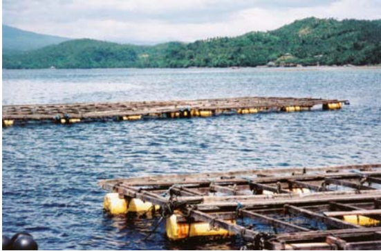
Satellite rafts for pearl cultivation